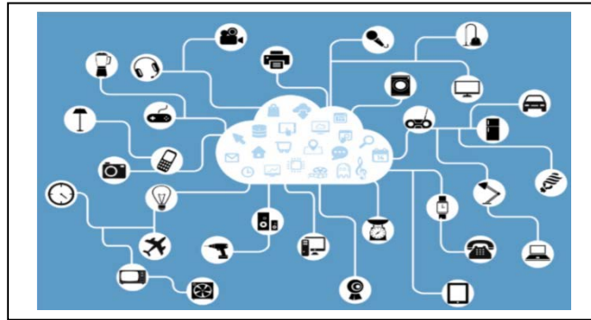
Figure 1. Interconnecting all things.

in education, we are able to create multiple application scenarios of intelligent education, which helps make sure the equal access to education by providing plentiful educational resources and making it possible for students to communicate anytime, anywhere.